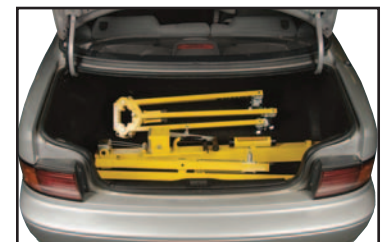
Fits in a car trunk!