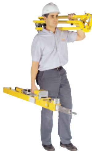
Lift conveniently disassembles for easy transport. Convenient carrying handle!