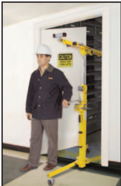
Fits through doorways!