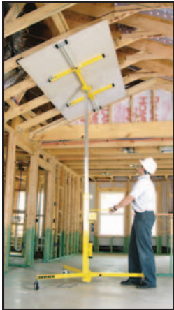
Cradle tilts up to 45° for cathedral ceilings.