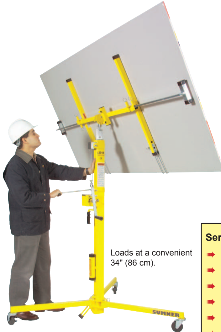
Loads at a convenient 34" (86 cm).