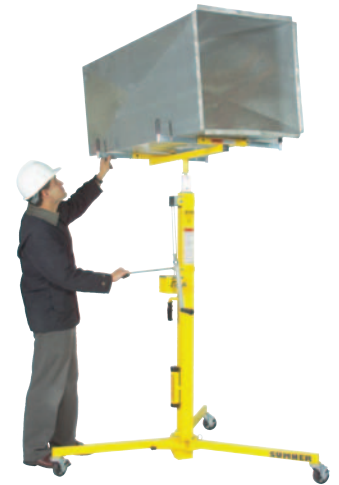
Optional HVAC/ Light Cradle Part No. 784474